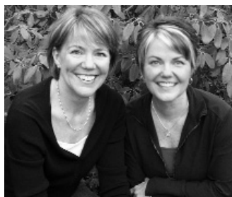
"The 2 Sisters"